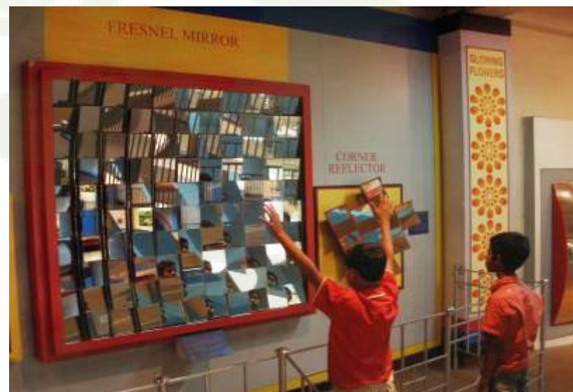
Interaction with 'Fresnel Mirror' exhibit at Science City, Kolkata