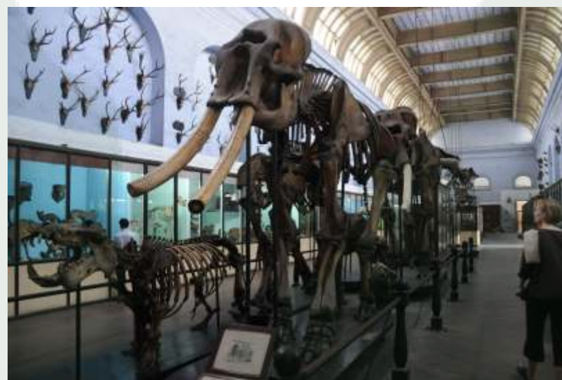
View of a gallery at Indian Museum, Kolkata