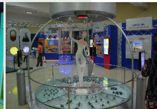
'Story of Oil' gallery at Jorhat Science Centre, Assam