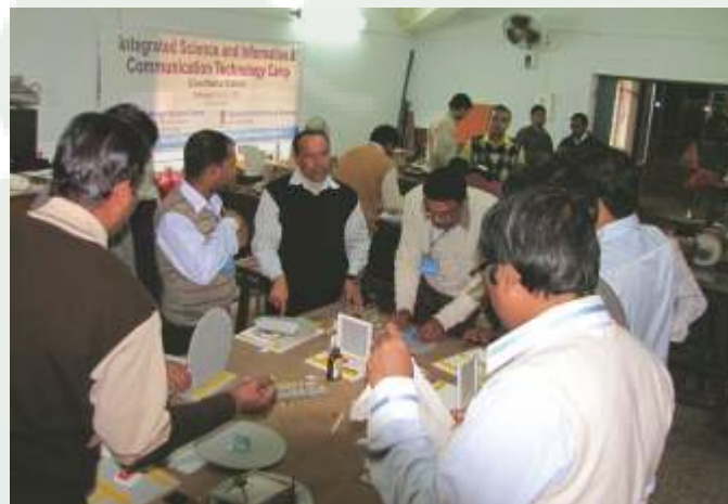
Community participation in the ICT Camp