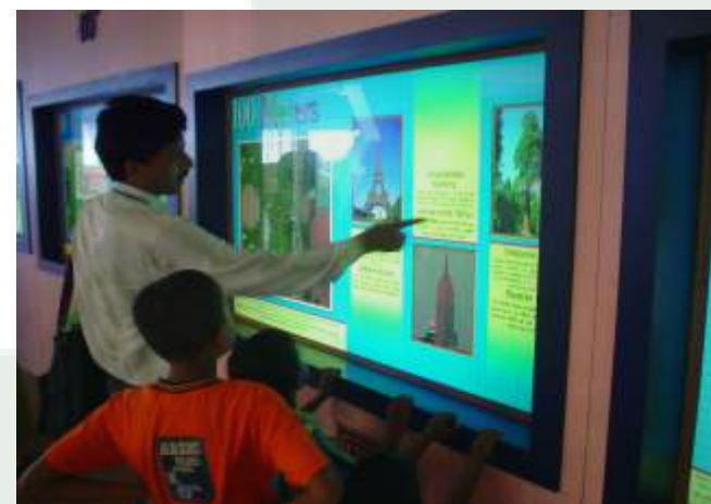
Visitors observing an exhibition at Science City, Kolkata