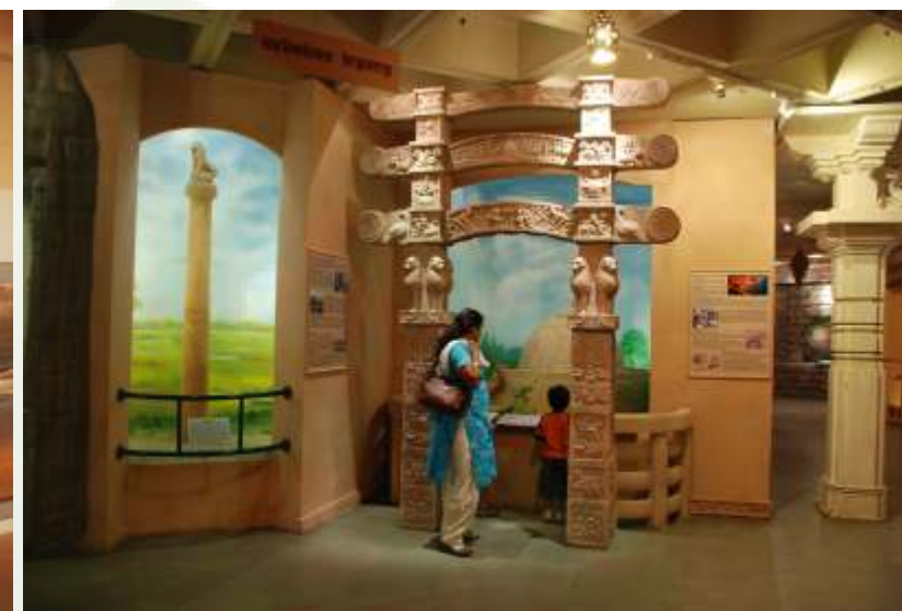
A view of the gallery at NSC, Delhi