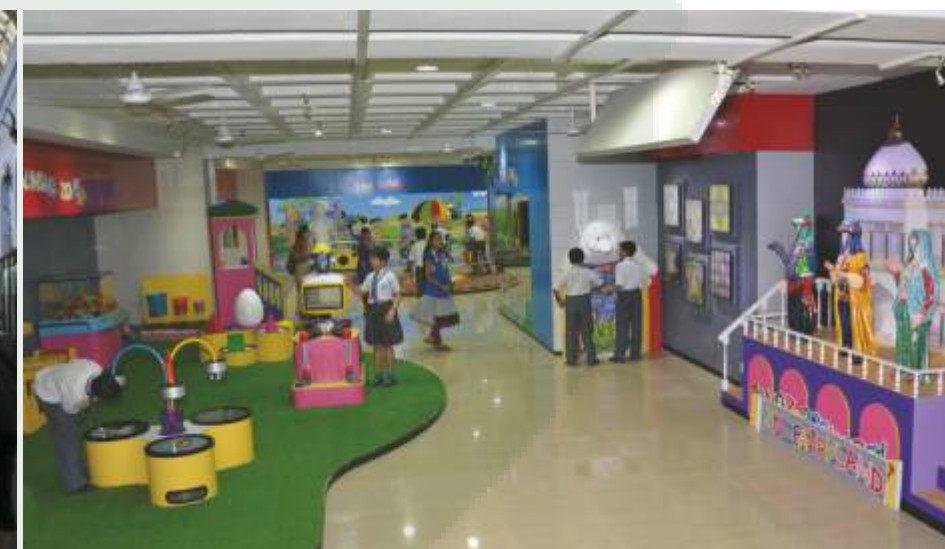
Children's gallery at BITM, Kolkata