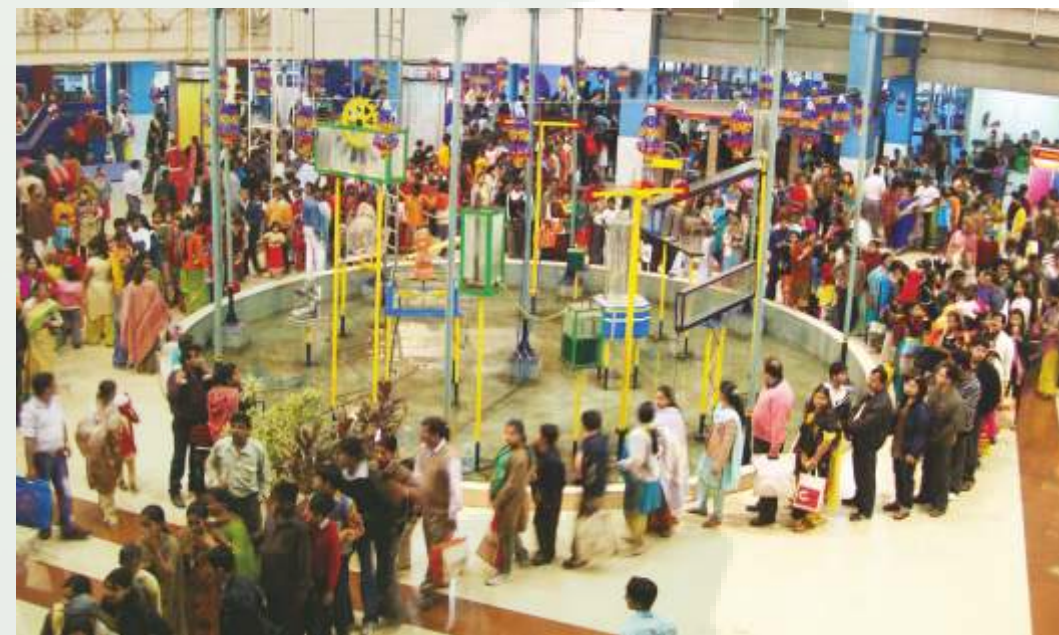
Visitors watching 'Energy Ball' exhibit at Science City, Kolkata